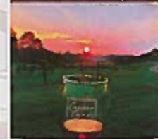
Caesar Creek Vineyards