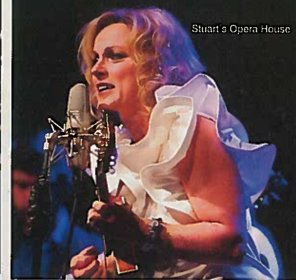
Stuart's Opera House