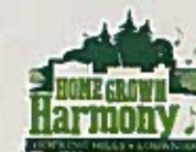
Concert in Downtown Logan

Elsewhere, sip wine and savor some songs at Hocking Hills Winery, Shade Winery and Rockside Vineyards, which regularly book musical acts. Millstone Southern Smoked BBQ offers outdoor concerts three times a week during warm-weather months. The new Casual Friday event at the Inn & Spa at Cedar Falls combines a farm-to-table menu with accompanying live acoustic musicians. Weekly summer concerts are also held in Downtown Logan.